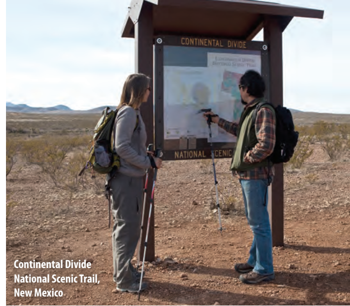
Continental Divide National Scenic Trail, New Mexico